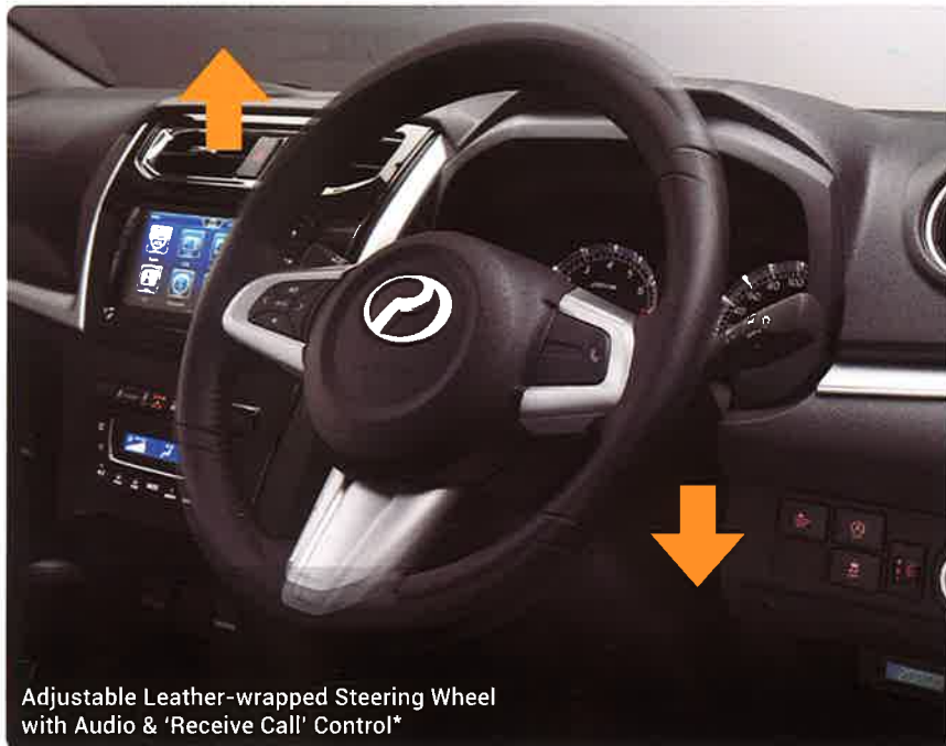
Adjustable Leather-wrapped Steering Wheel with Audio & 'Receive Call' Control*