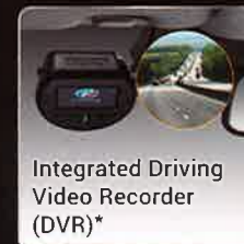
Integrated Driving Video Recorder (DVR)*