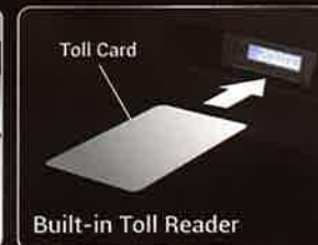
Built-in Toll Reader