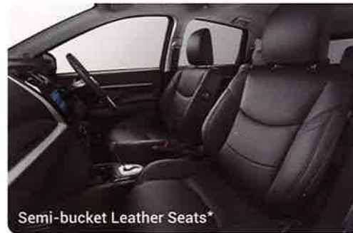
Semi-bucket Leather Seats*