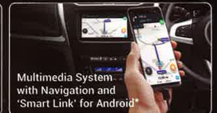
Multimedia System with Navigation and 'Smart Link' for Android*