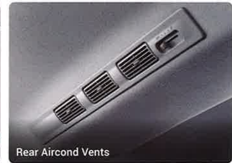
Rear Aircond Vents