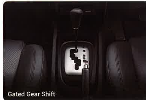
Gated Gear Shift