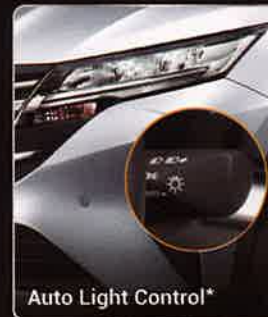
Auto Light Control*