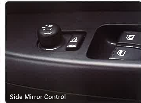
Side Mirror Control